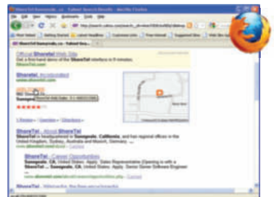
Figure 2: Web Dialer control shown in Mozilla Firefox